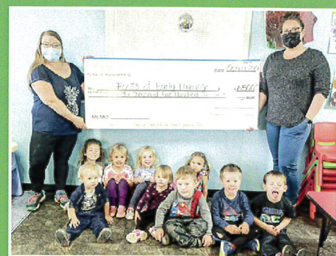
Roots of Early Learning – Portable storage shed.