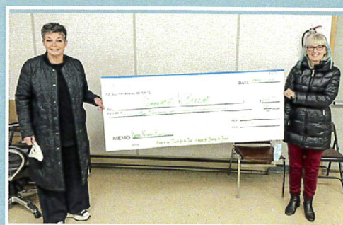
Killarney Communities in Bloom – Assist with 2022 spring planting.