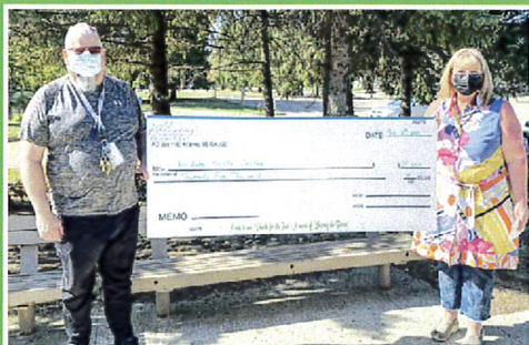
Tri-Lake Health Centre – Courtyard grounds improvements.