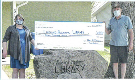
Lakeland Regional Library – For community history books, online newspaper and magazine subscriptions.

When you are thinking about donating to the Killarney Foundation or to the Killarney Hospital, please remember you can donate to a specific hospital account. A gift that keeps on giving and supports the Killarney Tri-Lake Hospital.