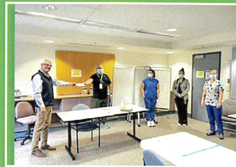
Prairie Mountain Health - Killarney Hospital – Assist with IV Pump replacements, replacement of radios and the Butterfly Project.

The Kinsmen club has started the fundraising off by donating $40,000 towards the project. This amazing donation has allowed the Prairie Mountain Health Region to engage with a consulting firm to develop a plan and cost estimates for the project.