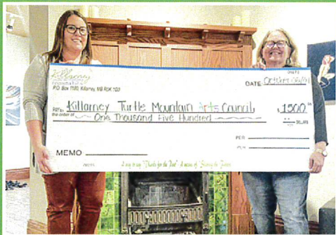
Killarney Turtle Mountain Arts Council – Printer and plexi-glass covers to protect displays.