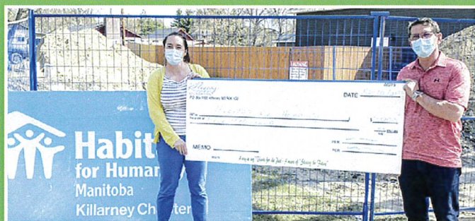
Habitat for Humanity, Killarney Chapter – Current build assistance.