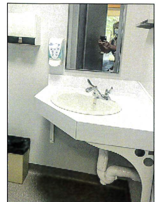
One of 16 washrooms that were completed this spring.