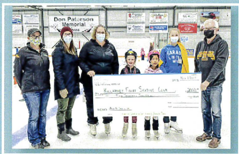
Killarney Figure Skating Club – Purchase of coaching iPads.