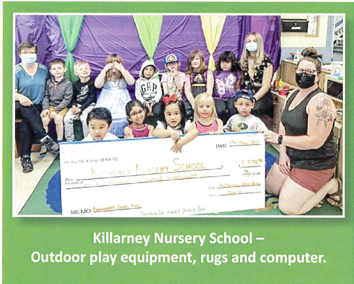
Killarney Nursery School – Outdoor play equipment, rugs and computer.

The Killarney Foundation strives to be a catalyst for strengthening community well-being, now and for future generations, by promoting philanthropy, creating partnerships and supporting diverse charitable organizations.