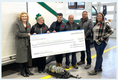
Fire Dept. for breathing apparatus