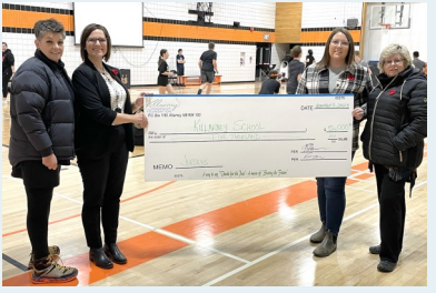
Killarney School for sports uniforms