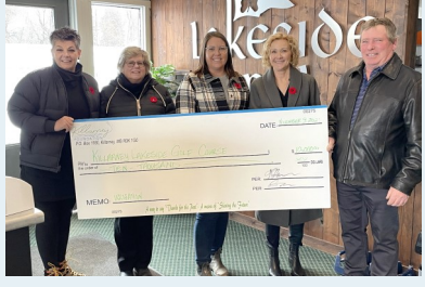
Golf Course for irrigation project