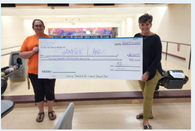
Bowling Alley for Pin Setters