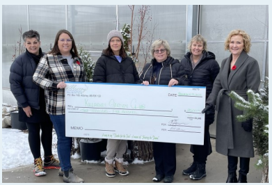
Garden Club for park beautification