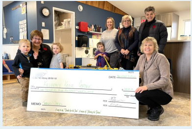
Kiddie Korner for tables & chairs