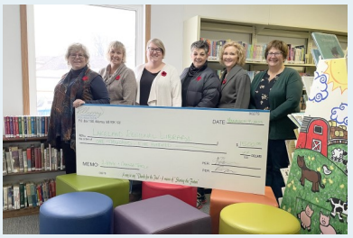
Library for book storage & change table