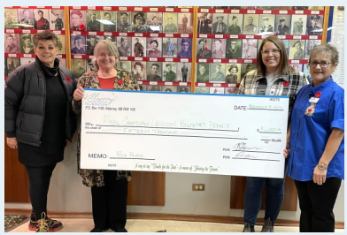
Killarney Legion for leaking roof repairs